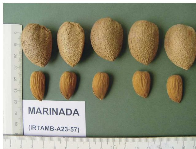
Fig. 3. 'Marinada' almonds.