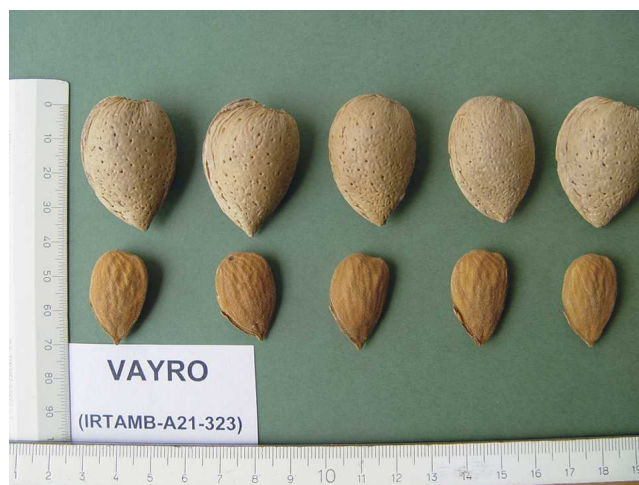
Fig. 5. 'Vayro' almonds.