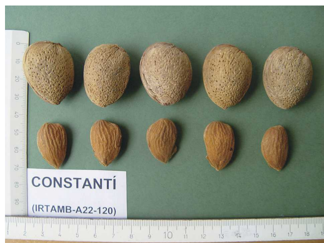
Fig. 2. 'Constantí' almonds.

All four cultivars ('Vayro', 'Marinada', 'Constantí', and 'Tarraco') have shown heavy and consistent cropping in experimental trials.