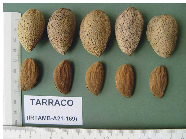
Fig. 4. 'Tarraco' almonds.